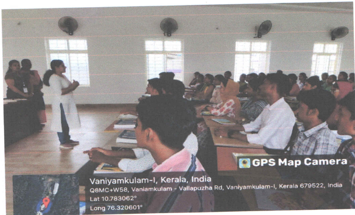
Vaniyamkulam-I, Kerala, India Q8MC+W58, Vaniyamkulam - Vallapuzha Rd, Vaniyamkulam-I, Kerala 679522, India Lat 10.783062° Long 76.320601°