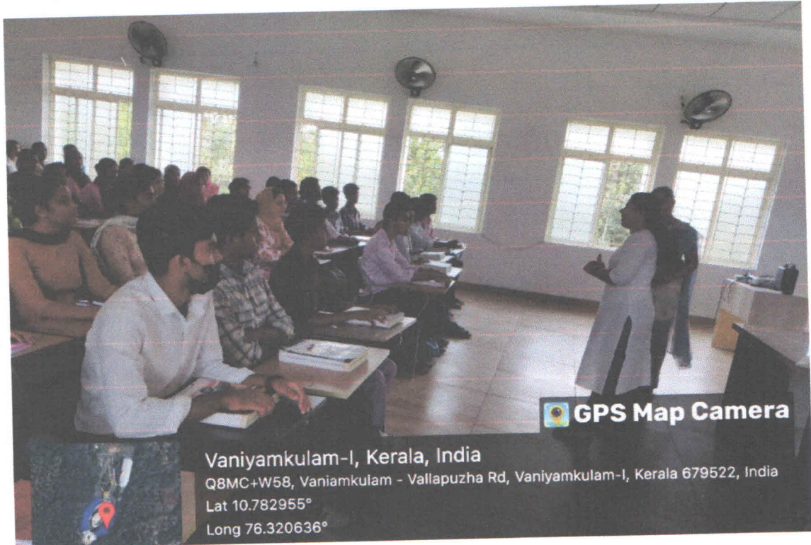
Vaniyamkulam-I, Kerala, India Q8MC+W58, Vaniyamkulam - Vallapuzha Rd, Vaniyamkulam-I, Kerala 679522, India Lat 10.782955° Long 76.320636°